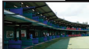
World Of Golf Surrey