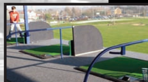
World Of Golf Sidcup