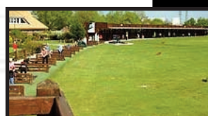
Golf L'île Fleurie